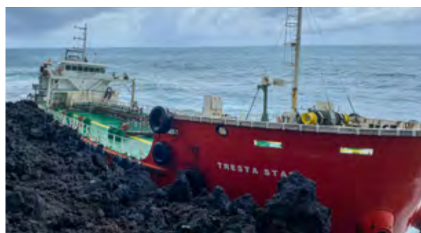
Tanker Tresta Star stranded on lava shore in Reunion island after Batsirai hurricane

A study conducted by the World Weather Attribution group concluded that climate change increased the amount of rainfall associated with the storms, contributing to the damage they caused. 76