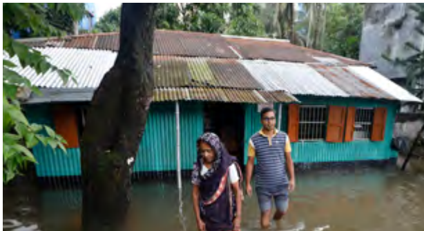
Barisal, Bangladesh - October 25, 2022: Due to the impact of Cyclone Sitrang, water has accumulated in many areas of Barisal city due to rains throughout the day.

Climate change is increasing rainfall rates associated with tropical cyclones, as higher temperatures allow the atmosphere to accumulate more water. 96