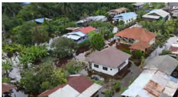
A flooded area in Klang during the January 2022 Malaysian floods.

As the planet warms, the atmosphere is able to accumulate more water, which can lead to more intense downpours. 74 Also, tropical cyclones and tropical storms are becoming more intense due to climate change. 75