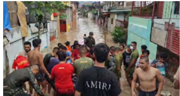
Flood Rescue Operation in Barangay San Jose Gusu due to Typhoon Paeng or Tropical Storm Nalgae.

As the planet warms, the atmosphere is able to accumulate more water, which can lead to more intense downpours. 97 Also, tropical cyclones and tropical storms are becoming more intense due to climate change. 98